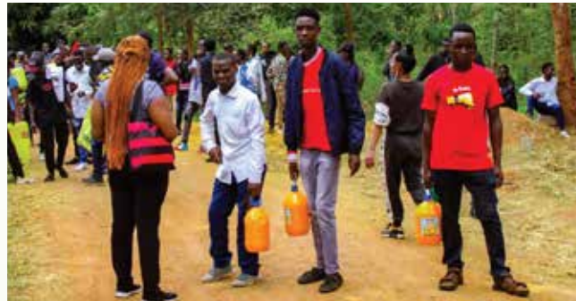
Catholic Action students during a hike

MUTCA members have also impacted the community around Murang'a. On 26 February 2023, they visited Sagana Home of the Aged and carried out activities such as feeding the animals, cleaning the compound, cooking and eating a meal with the residents, and work-