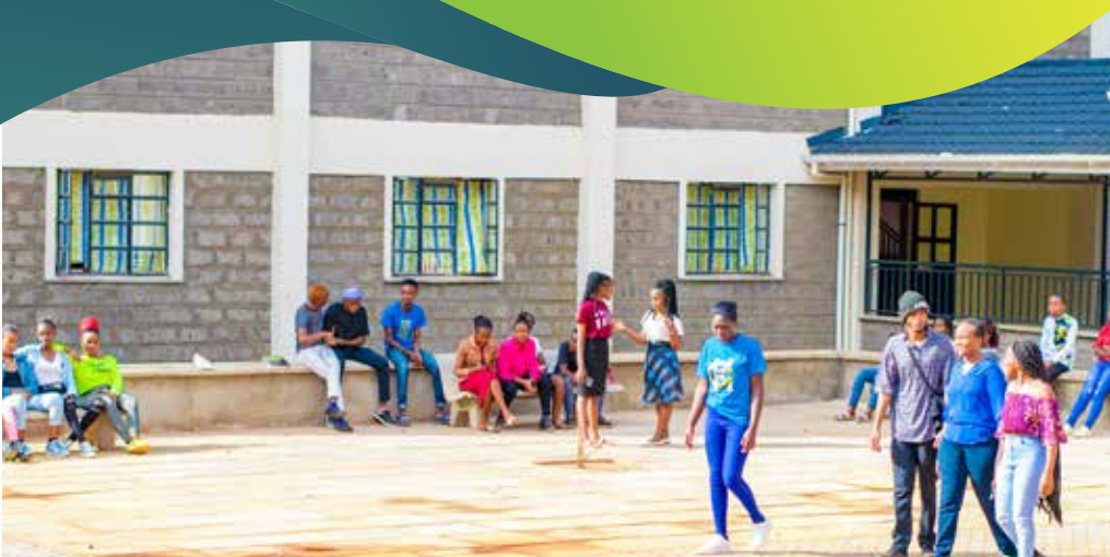
Students at the hostel block