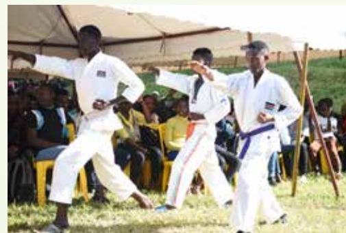
Karate club members showcasing their talent during the matriculation ceremony