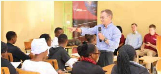
A guest speaker making a presentation to IT students

The world eagerly waits for your professional contribution.