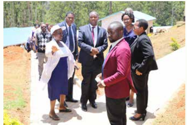
Senators taking a tour of Mariira Campus