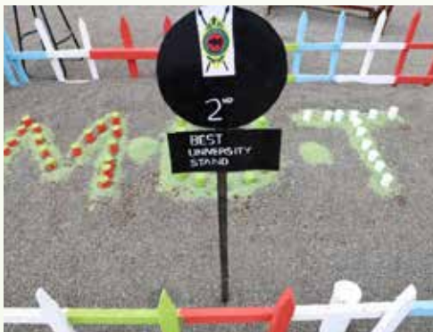
MUT awarded the second best university stand at the ASK Show in Nyeri