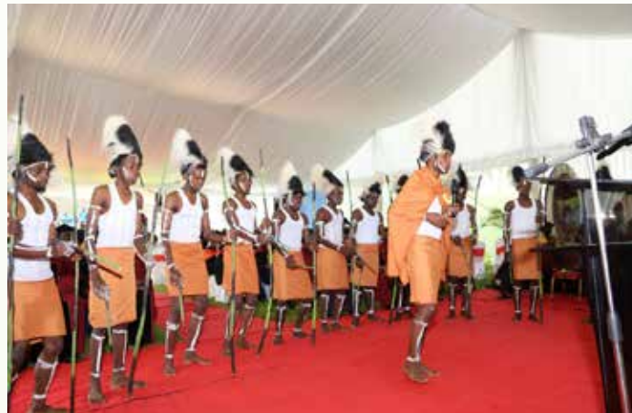
Students performing during a graduation ceremony

The entire student body exercises its constitutional right to elect its leaders annually, in accordance with the student constitution. The elected leaders form the Murang'a University