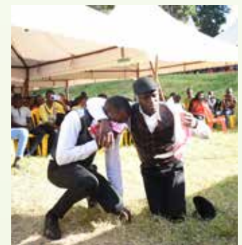
Drama club members performing a narrative