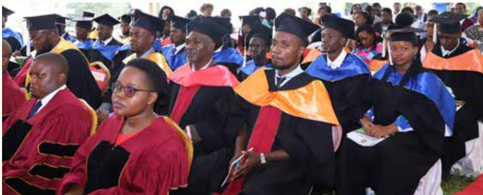
Graduands at a past ceremony

T oday, I extend my heartfelt congratulations to the 2023 Graduating Class. Your graduation is a testimony to your perseverance, dedication, and unwavering commitment to learning in a blended environment.