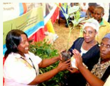
Donating seedlings to mark the World Water Day

The directorate, which is part of the Division of Academic and Student Affairs, also creates partnerships with academic institutions, industry players. It also engages with various stakeholders, including NGOs and government bodies. It has a Partnerships Board, appointed by the Vice Chancellor, which is composed of faculty members and is responsible for vetting partnerships.