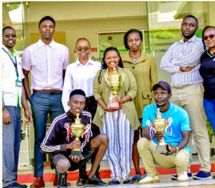
Drama Club trophy trove