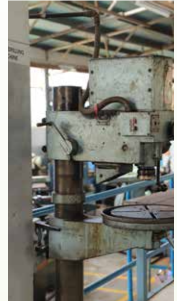
Pillar drilling machine at the engineering workshop