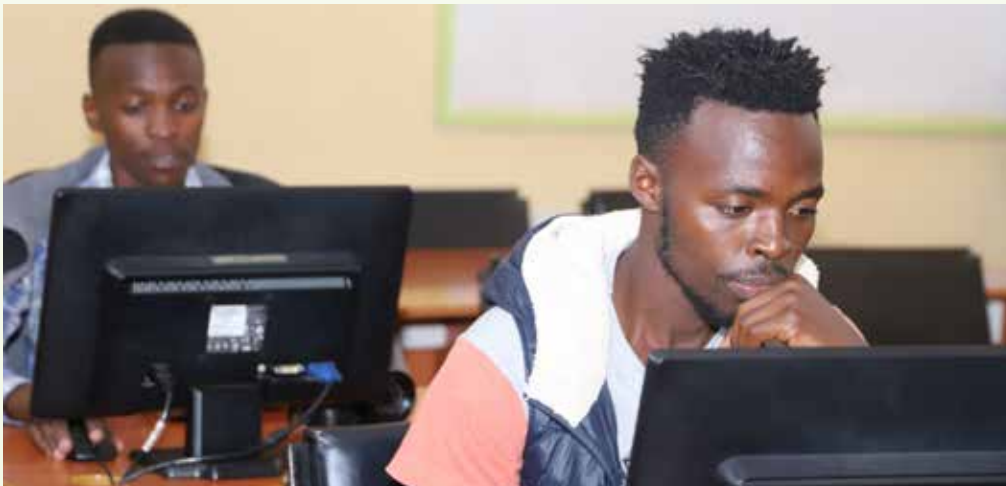
Students in a computer lab

MUT was ranked 11th out of 124 institutions of higher learning in Kenya.