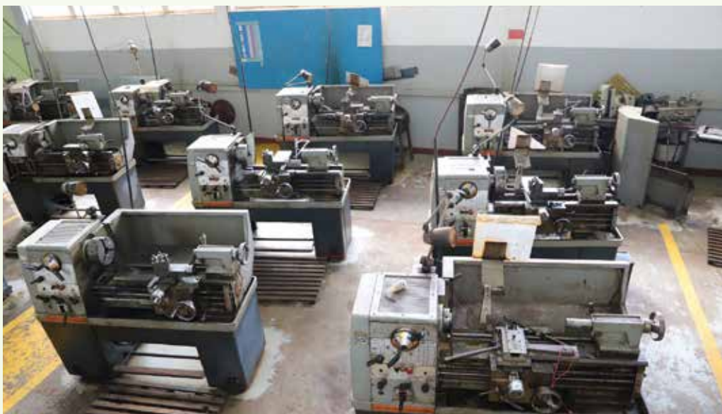
Lathe machines in the mechanical workshop