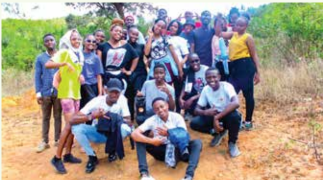
Students on a hike