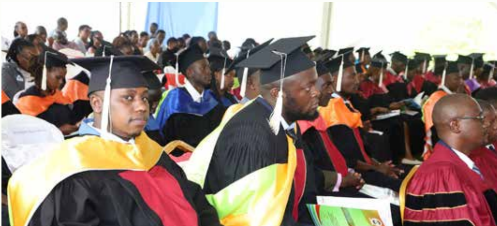
A section of graduands at a past ceremony