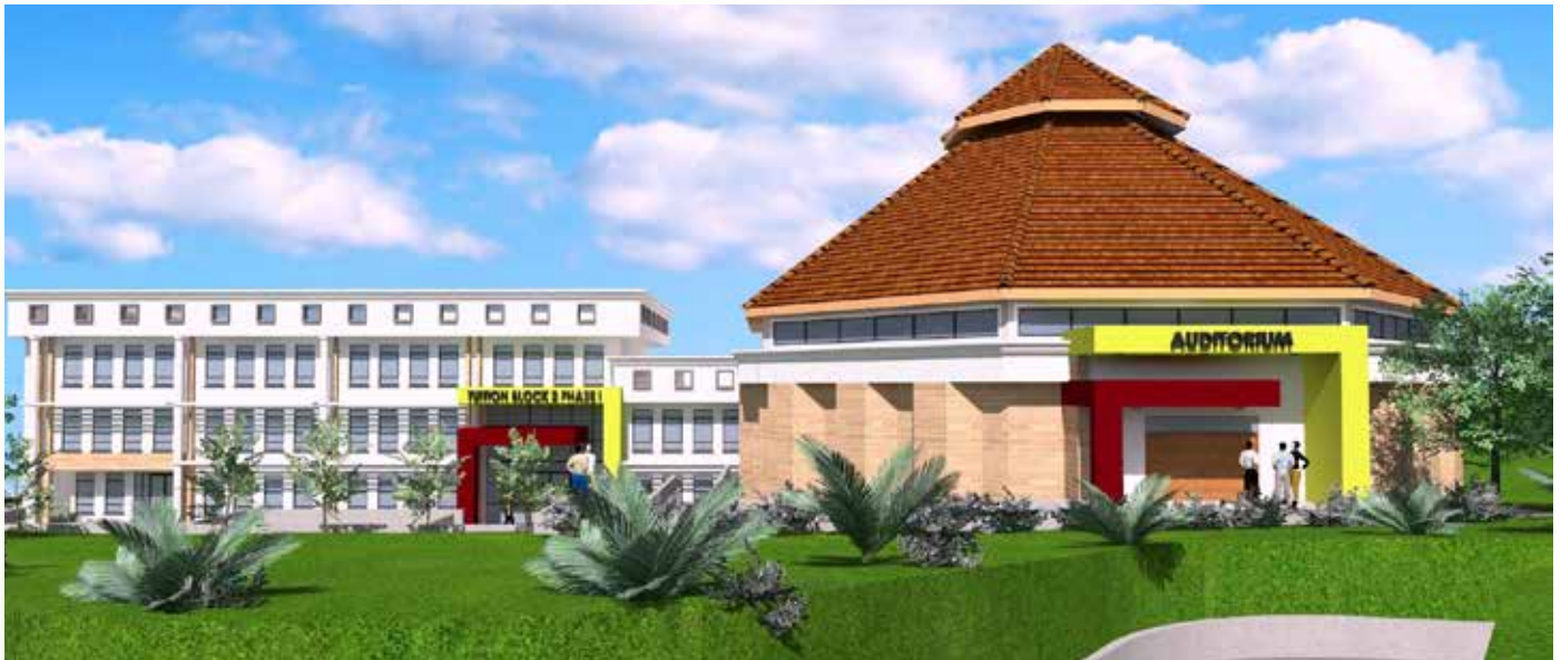
An artist's impression of proposed tuition block