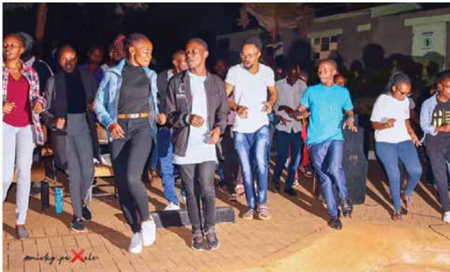
Christian Union members dancing at MUT