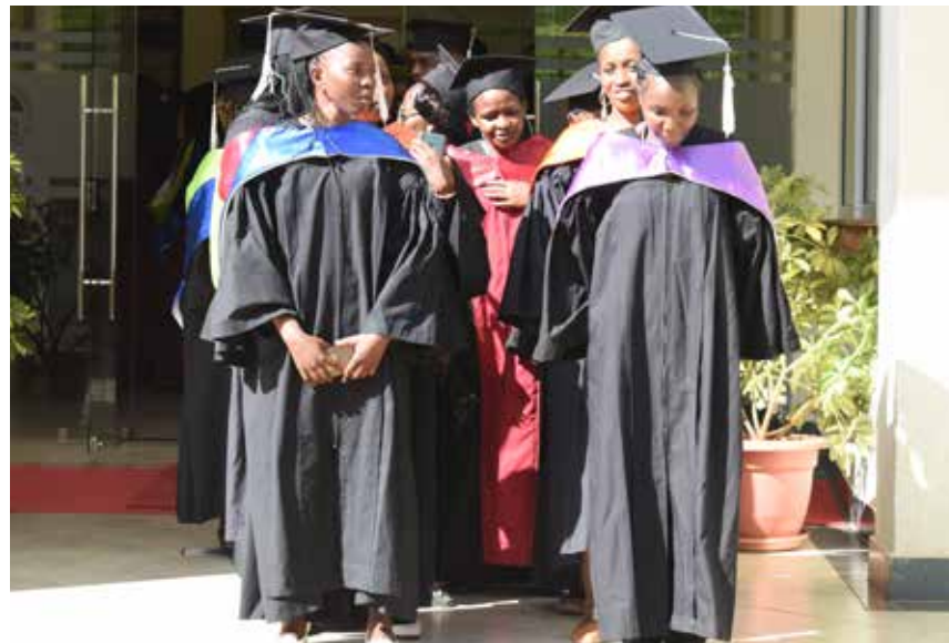
MUT alumni preparing to lead the faculty march during the first year matriculation ceremony

Always bear in mind that your time at Murang'a University of Technology is a foundation, a launchpad to the vast