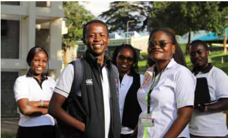
A section of staff members