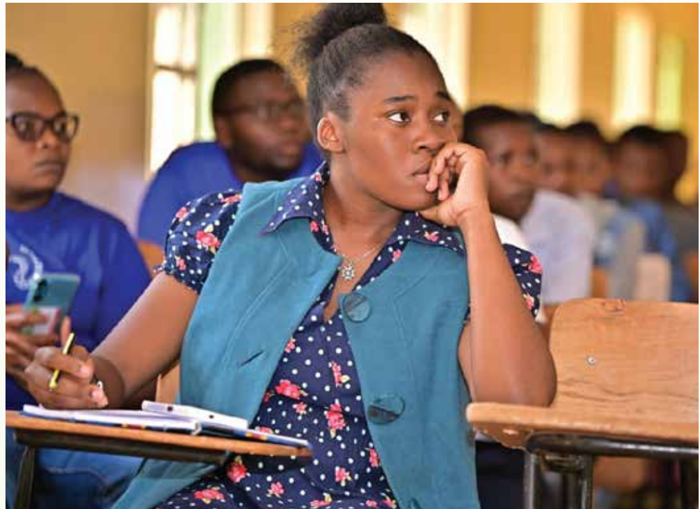
Students during a lecture

Once the exams are done, the Examinations Office springs into coordinated ac-