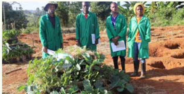
AGED students collecting data on integrated pest management at Mariira Farm