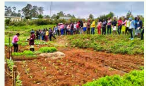
NRF funded youth empowerment on climate smart agriculture at Mariira Campus