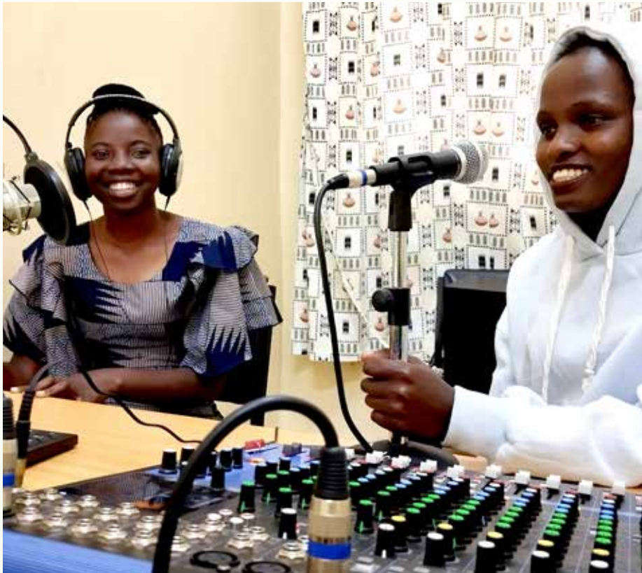
A session in the radio studio

Industrial attachment is an industry-based practical training experience that prepares trainees for the tasks they are expected to perform on completion of their training. The purpose of industrial attachment at Murang'a University of Technology is to produce practically oriented graduates who meet the requisite job-related competences of their future careers.