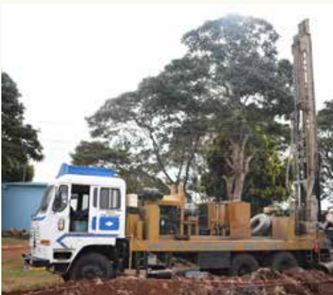
Borehole drilling exercise at MUT