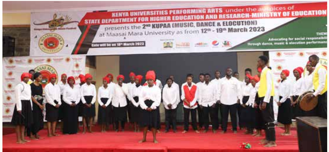
Performance at Maasai Mara University

"The club has taught me to accept criticism from other directors and