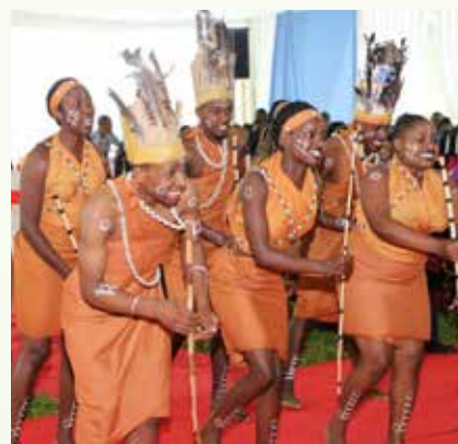
Students performing at a past graduation