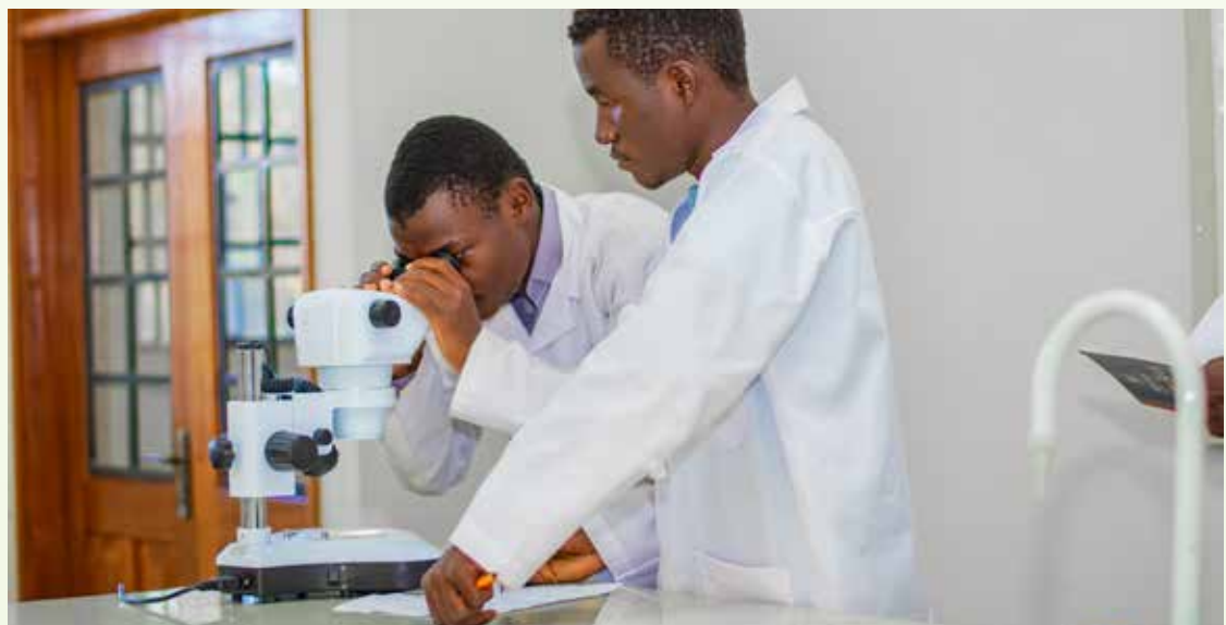
Students in the science lab

The University will assist in managing wetland areas and climate change through planting of trees at catchment areas so that there will be water sources for increasing population in the future.