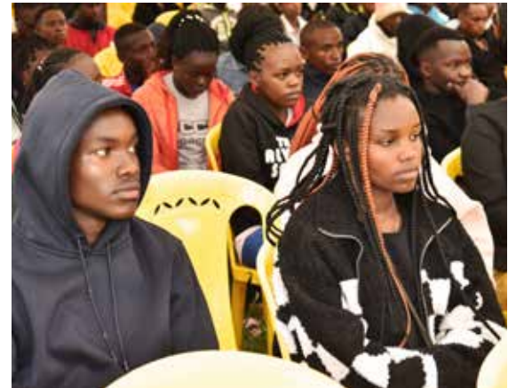
A section of first year students during the orientation