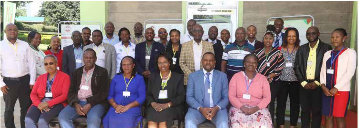
DVC, ASA poses for a photo with participants after a climate smart agriculture curriculum and short courses validation meeting