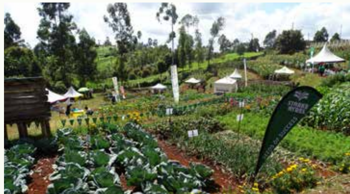
Demonstration plots at Mariira farm

C ongratulations to our 2023 graduates! On behalf of myself and the entire Mariira Campus team, we applaud your achievements that brought you to this pivotal moment. This graduation is not just an end, but the start of many more opportunities ahead.