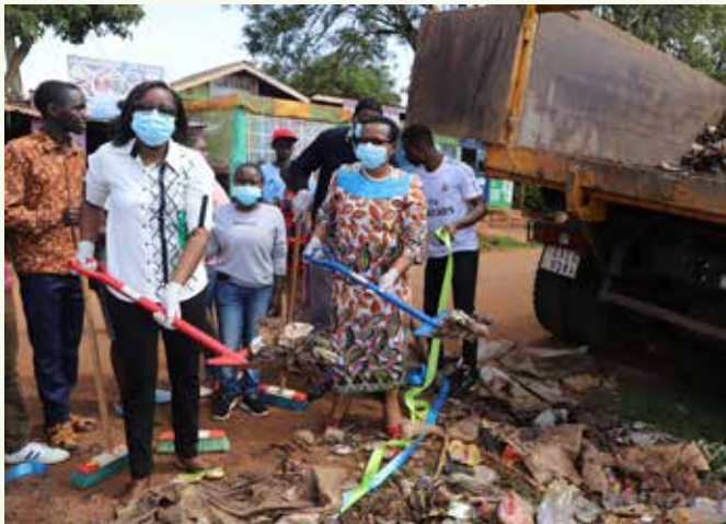
DVC, F&D and Murang'a Municipal Manager leading a clean-up exercise in Murang'a

The club is committed to continuing its work in environmental conservation. Members are planning to plant trees, organize more clean-up events, and educate the community about the importance of sustainability. They are confident that they can make a difference in the fight against climate change and other environmental challenges facing the world.