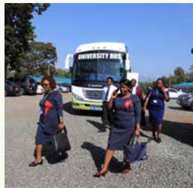
Senators arriving for a meeting at Mariira Campus