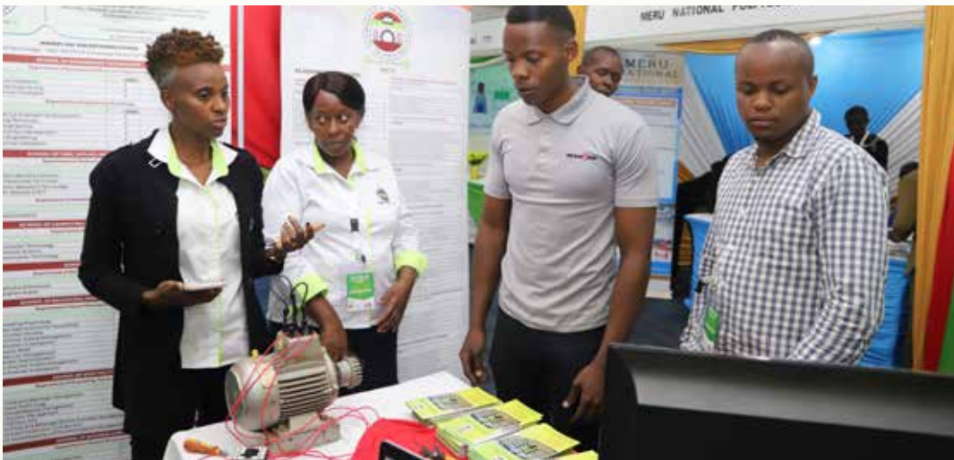
MUT representatives at the Tech and Innovation Summit At KICC showcasing an innovation for industrial control using the Internet of Things