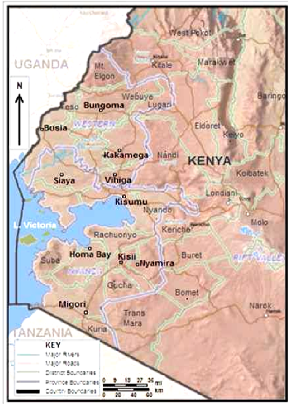
Figure 2. Map of Western tourism circuit, Kenya

expectations. Gap two is the difference between manager’s perceptions of service quality and service quality specifications. Gap three is the difference between service quality specifications and actual service delivery. Gap four is the difference between service delivery and what is communicated externally. Gap five is the difference between what customers